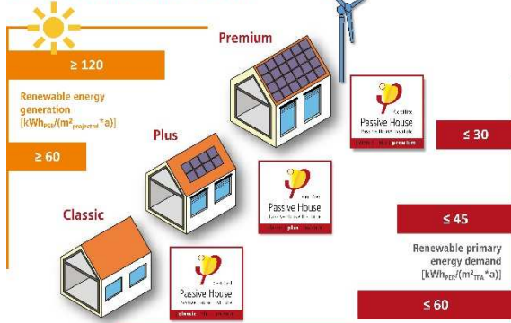
Illustration: PER demand and PER generation in relation to the Passive House Classes Classic, Plus and Premium

Renewable energy generation is not necessary for achieving the Passive House Classic category. However, if energy is produced, then with appropriate energy generation the building can have a PER demand of 75 \text{ kWh}/\text{m}^2 of treated floor area a year and may still be certified as a Passive House Classic. Within certain limits, a higher renewable primary energy demand can therefore be compensated through higher renewable energy generation. This principle also applies for the Plus and Premium classes. Here, a reduced demand can compensate for less energy generation.